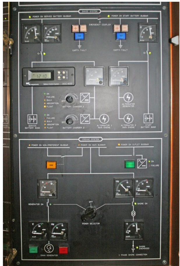
Control panel in saloon