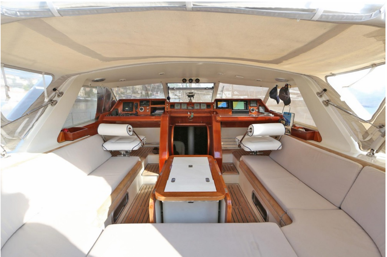
Center cockpit and nav stations