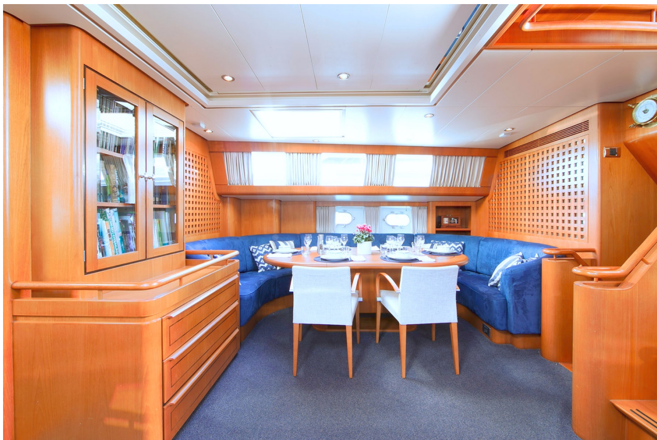
Dining area on the Stb side