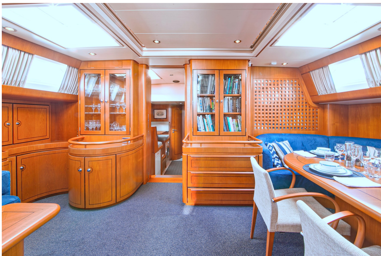
Lower saloon looking forward