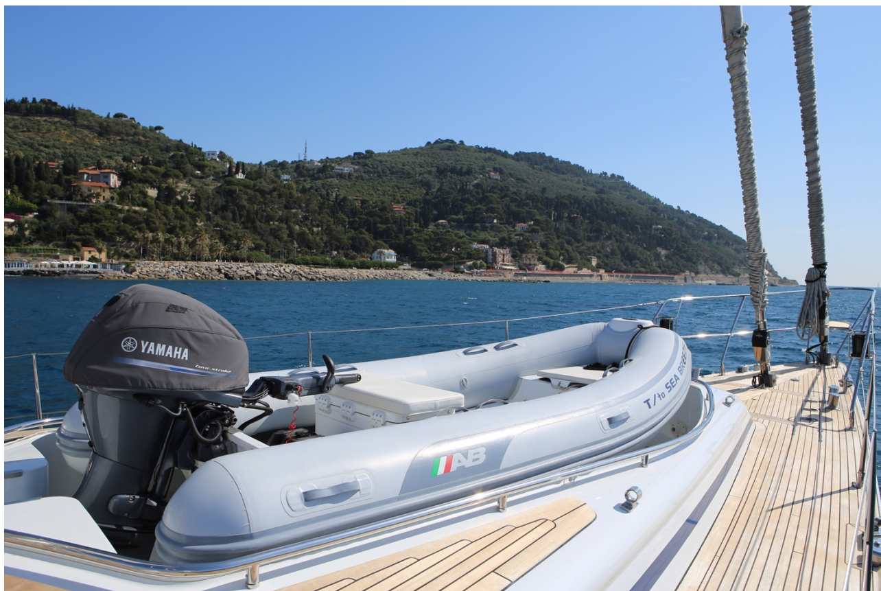
Foredeck with recessed dinghy storage / Jacuzzi