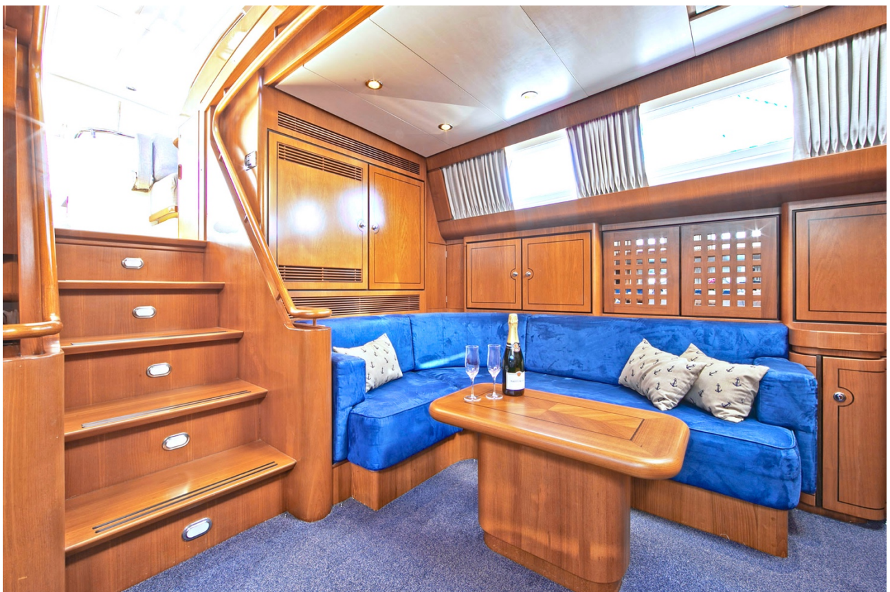
Lower saloon (Portside)