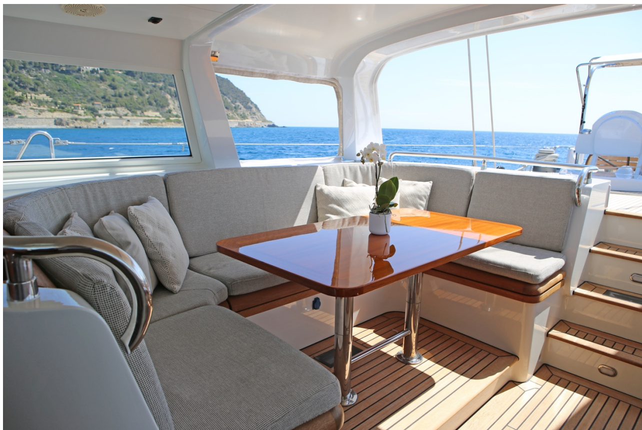
The aft section of the deckhouse can be conveniently moved forward with push-button