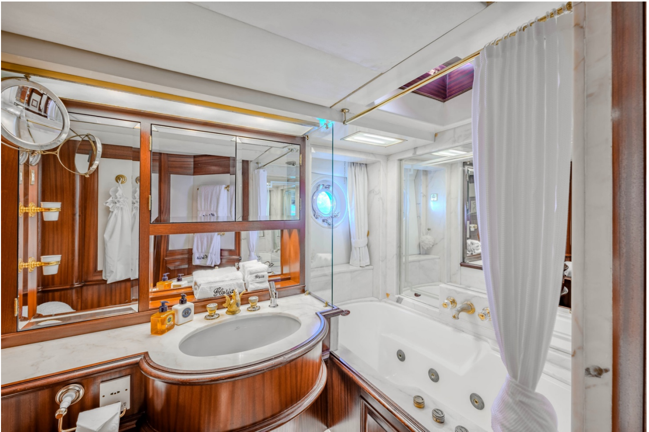
Owner bathroom with jacuzzi