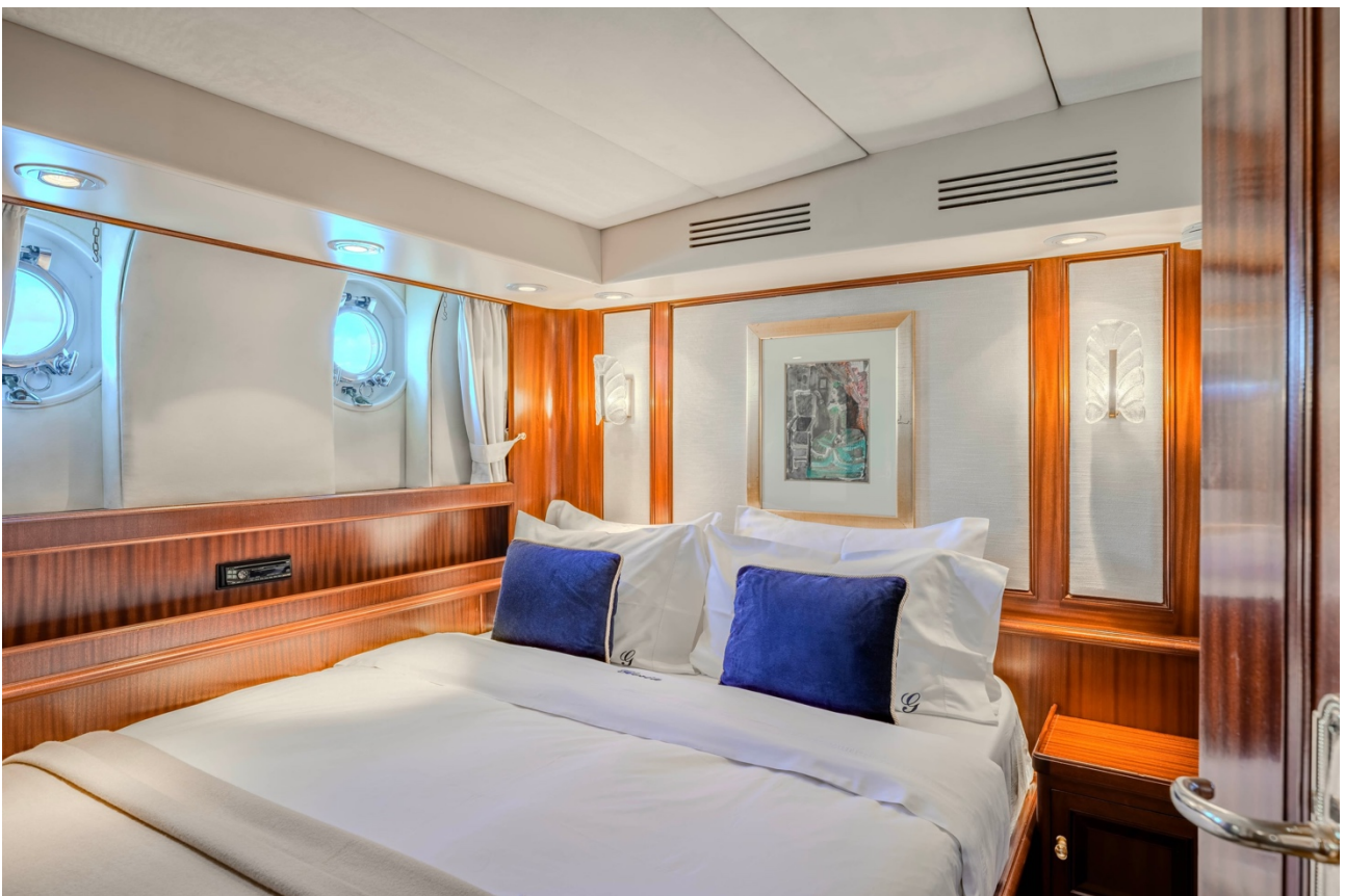
VIP guest cabin