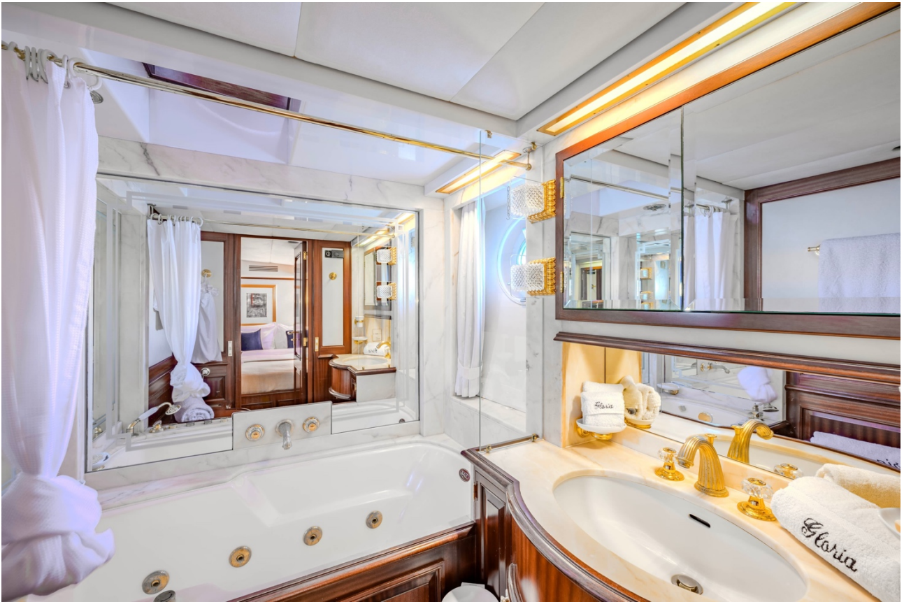
Guest bathroom with jacuzzi