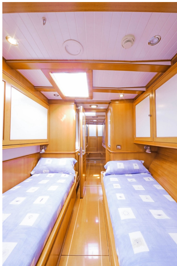
Double/triple guest cabin