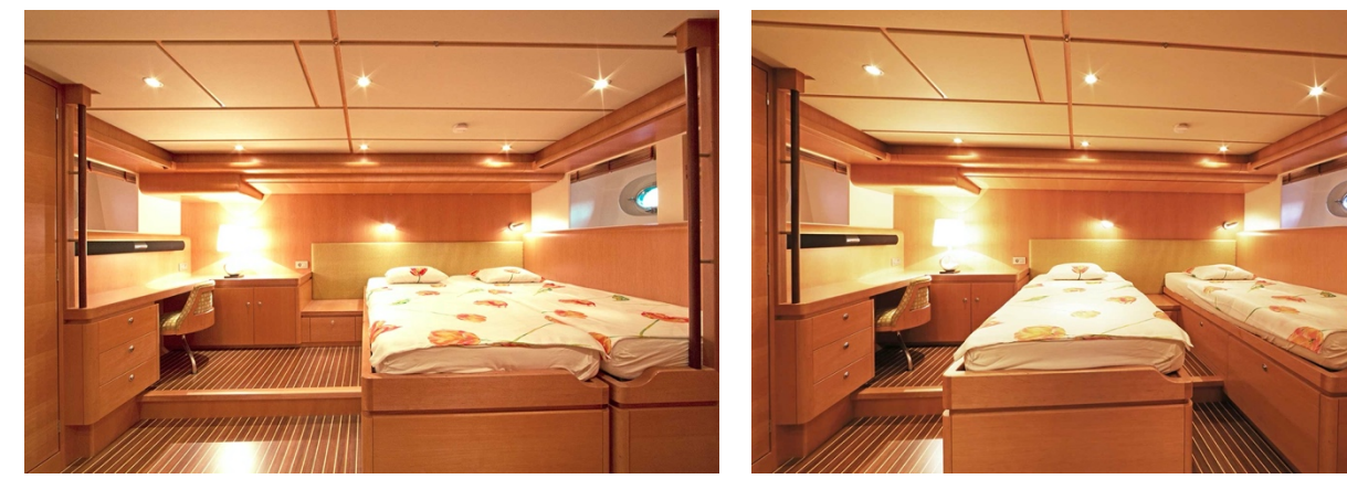
Double bed / Single beds accommodation