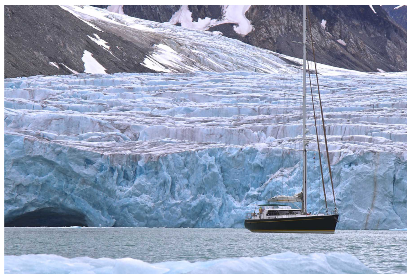
Spitzbergen Expedition 2015