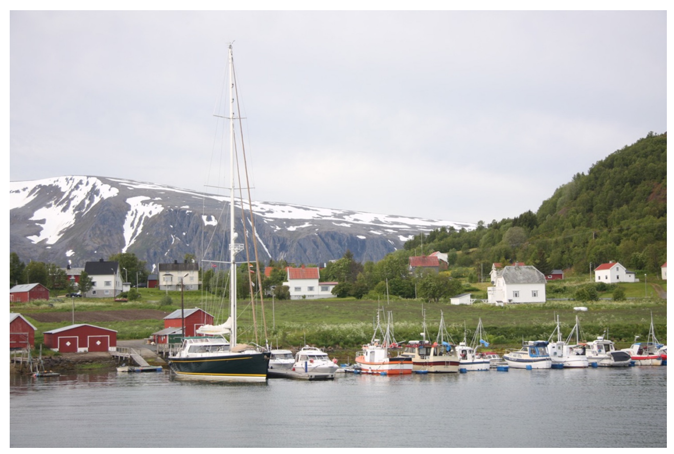
Spitzbergen Expedition 2015