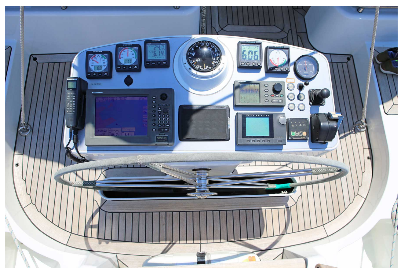
Aft steering position