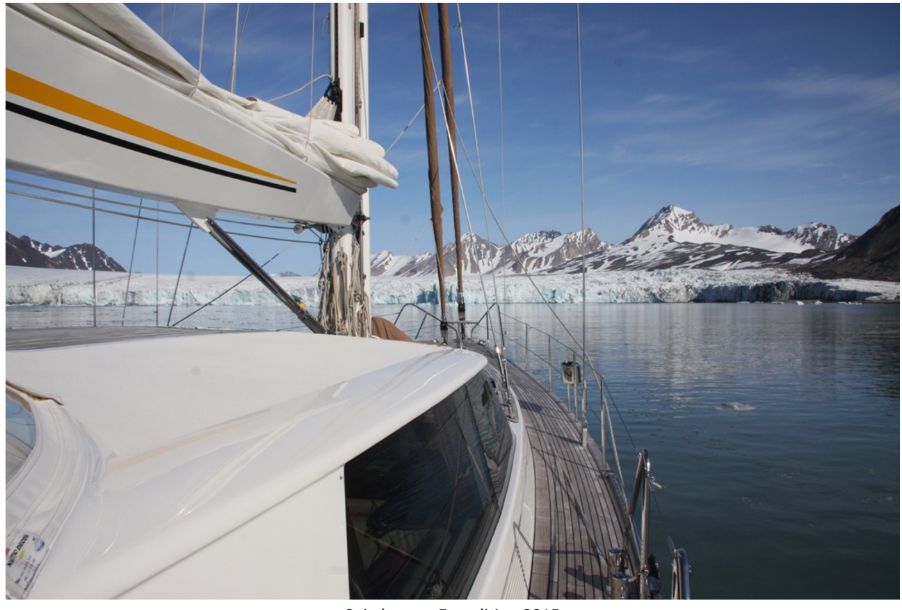
Spitzbergen Expedition 2015