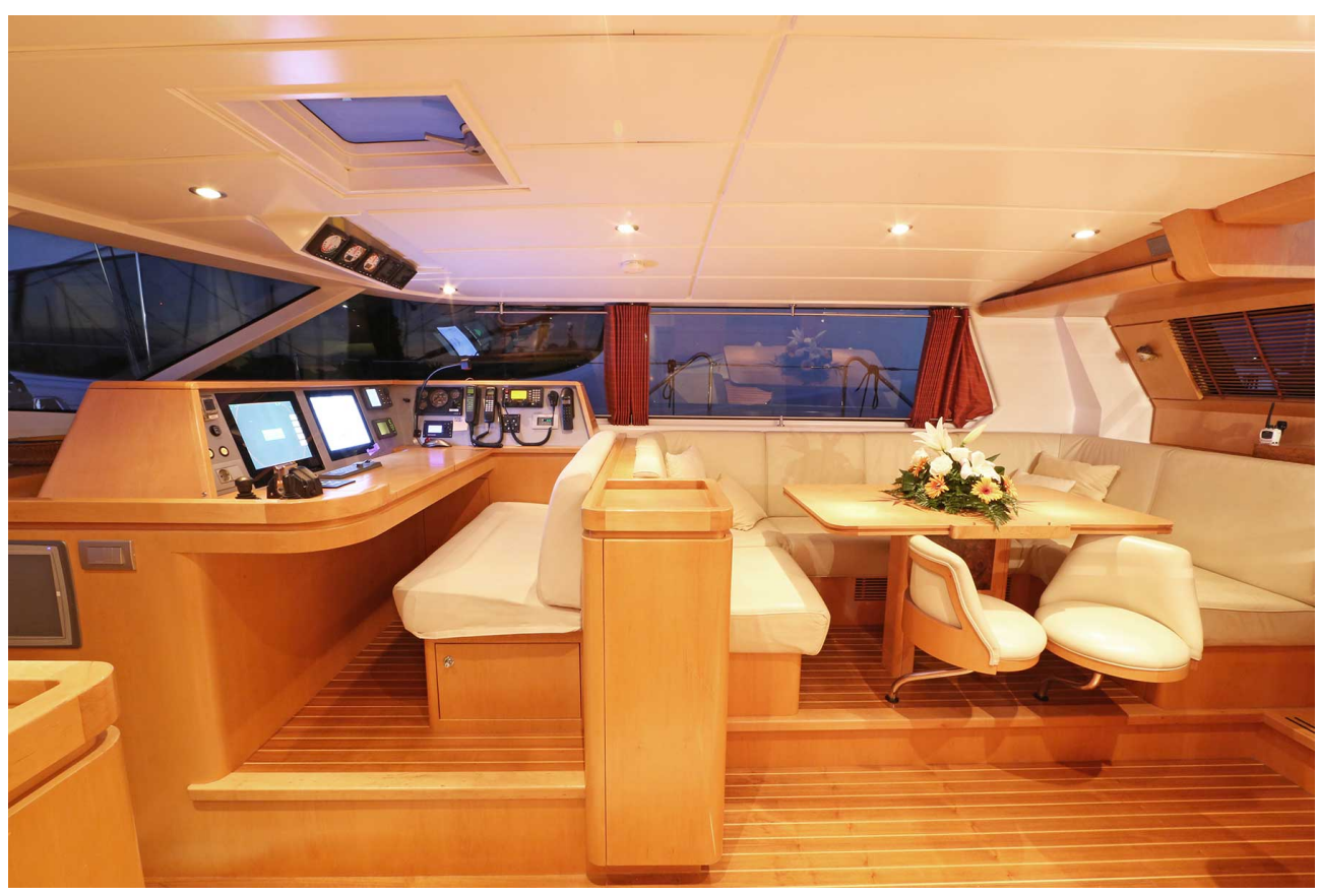
Nav station starboardside