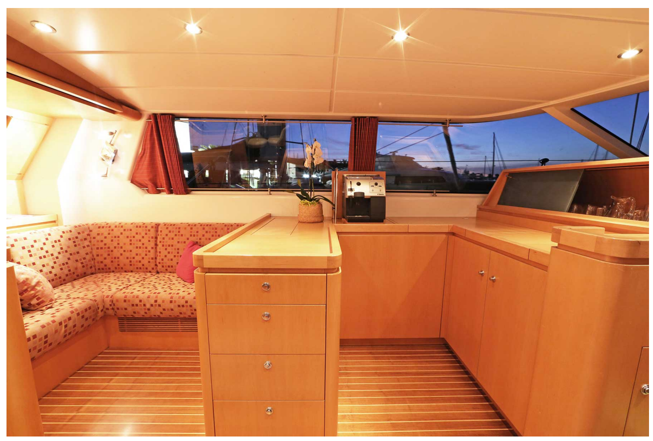
Settee and Bar Portside