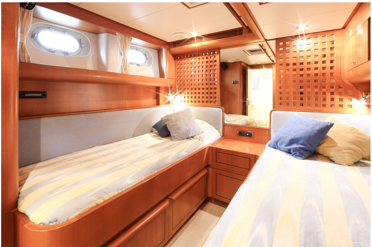
Twin guest cabin 1