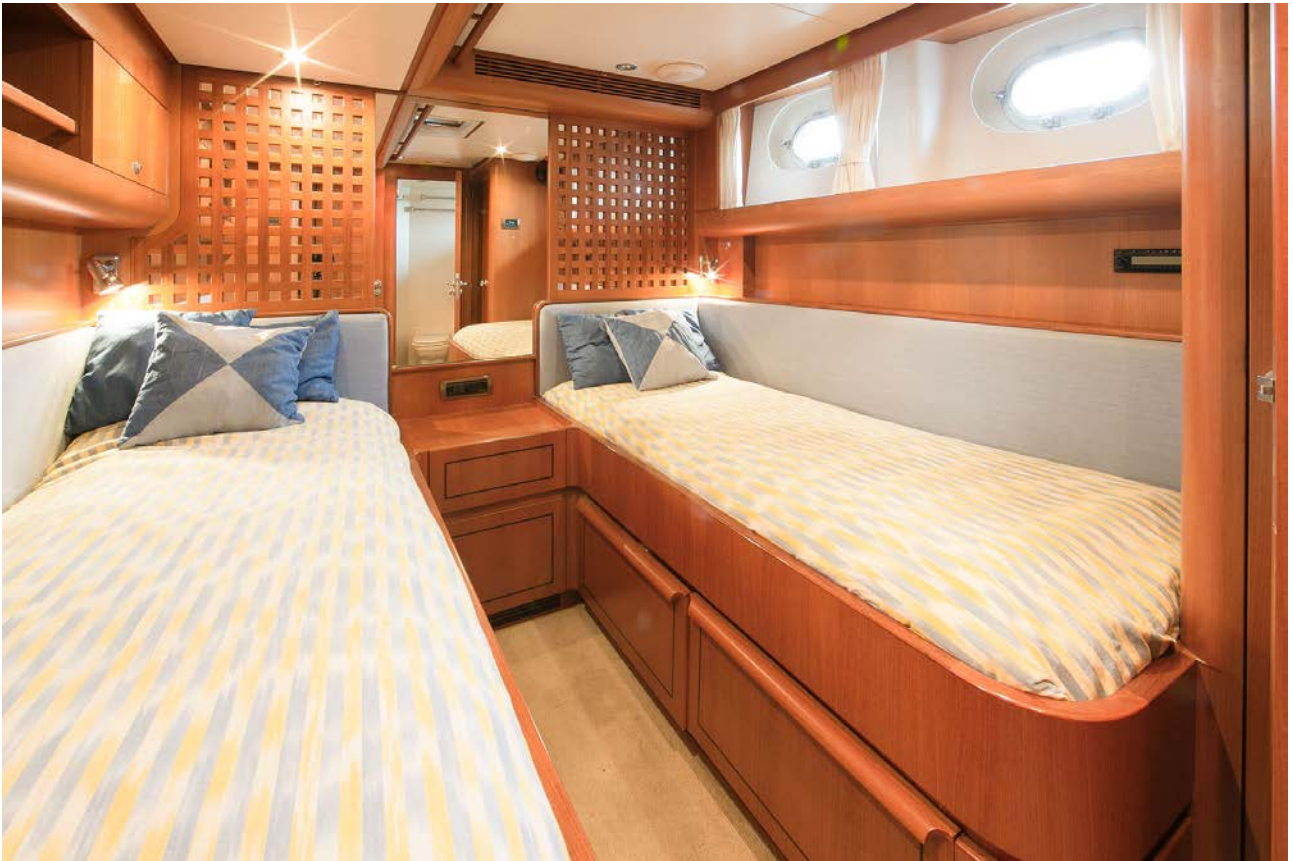
Twin guest cabin 2