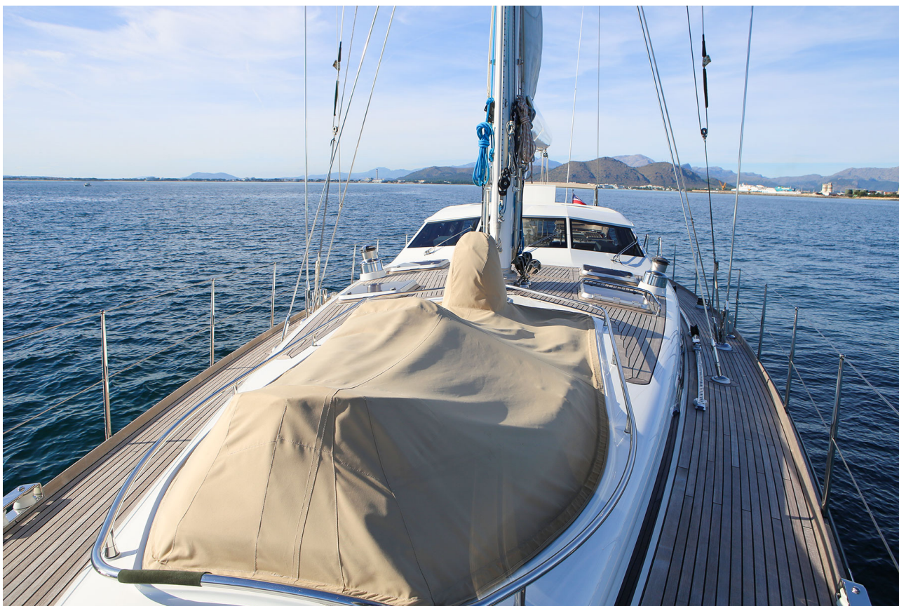
Recessed dinghy storage / Whirlpool