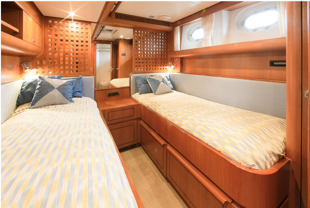
Twin guest cabin 2