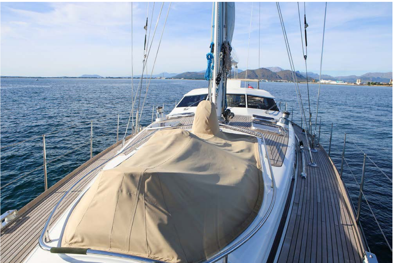
Recessed dinghy storage / Whirlpool